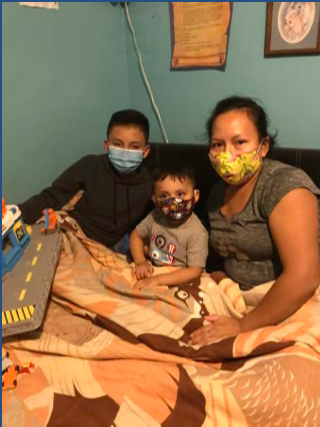
“Family of Three”

Out of concern for Team Members that may not be able to afford meals around the holidays, Bolana held a lottery to give away 30 Holiday Dinners to support COVID-19 challenged Team Bolana families.