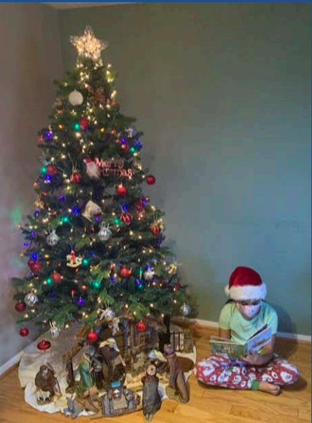
“Reading by the Christmas Tree”

Bolana Team members were invited to submit photos of their families celebrating Thanksgiving while staying safe and wearing face masks. Many wonderful entries were submitted and three winners were chosen by independent judges to receive Amazon Gift Cards! The winners are shown below: