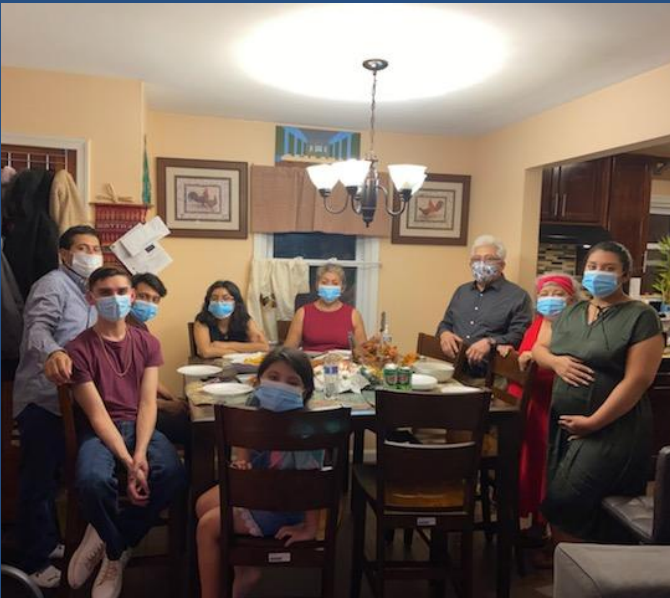
“Big Family Photo”