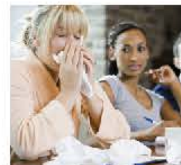
Exposure to airborne infectious agents