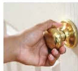
Direct contact with a contaminated surface