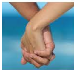
Direct contact with blood and/or bodily fluids