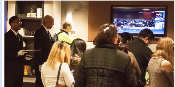
Bolana resident retention support event.

Here's a final thought; Jackie DeShannon's song, Put a Little Love in Your Heart, written in 1969 challenges us to make connections with our fellow man. Here are some of the lyrics: Think of your fellow man, lend him a helping hand, put a little love in your heart, and the world will be a better place for you and me you just wait and see. Team Bolana strives to do this daily with external and internal clients, tenants, owners and visitors WE SERVE .